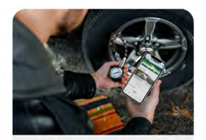
Maintenance & Mods