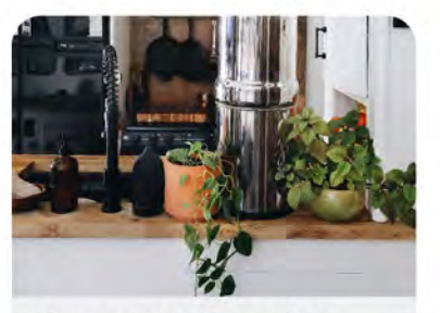
Grow and Care for Plants in Your RV