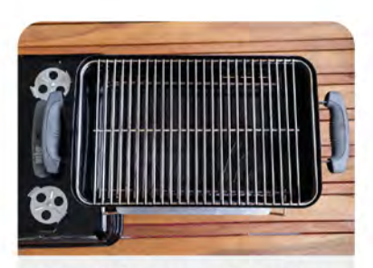
Food & Camp Cooking