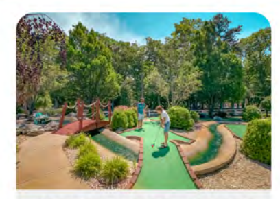
Best RV Campgrounds for Summer