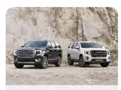
Best Vehicles for RV Towing