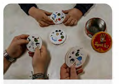
Favorite Campground Games