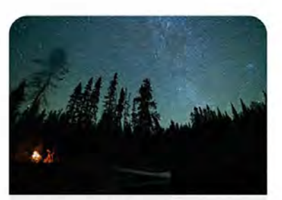
Dark Sky RV Campgrounds