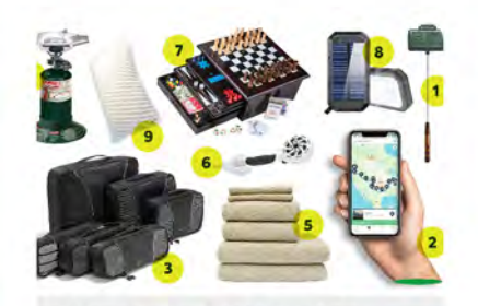
Ultimate Gift Guide for RVers