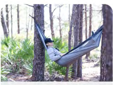
RVing Close to Home