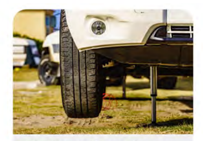
Find an RV Service Center