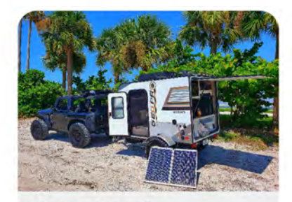
Gear & Tech