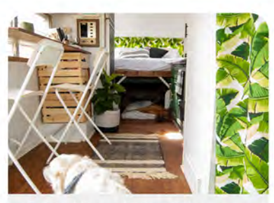
8 Myths of Vanlife