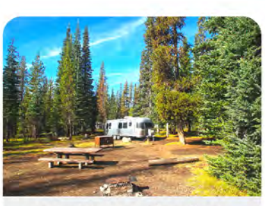
Travel & Destinations