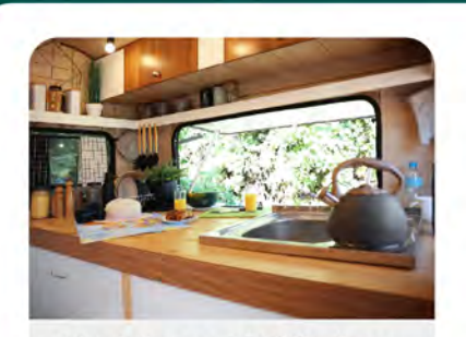
Must have RV Kitchen Accessories