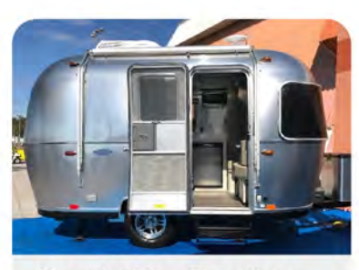
Should You Buy New or Used