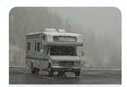
Extreme Weather in Your RV