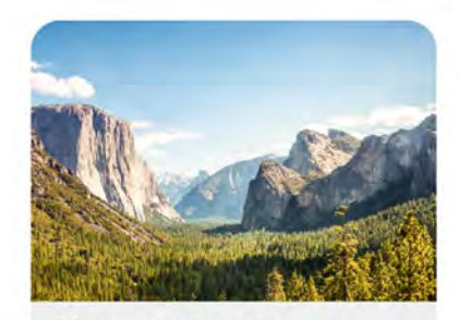
News & Events