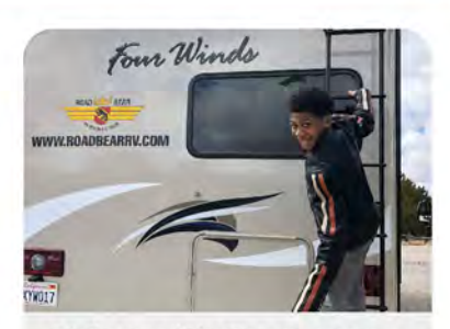
RVing with Teenagers