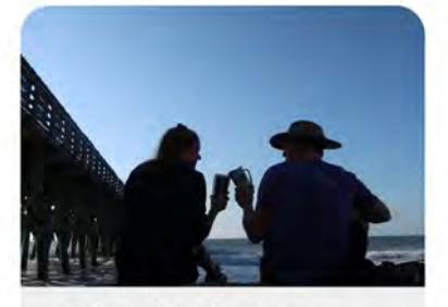
Make the Perfect Coffee in Your RV