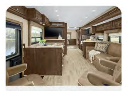
10 RVs Ideal for Couples