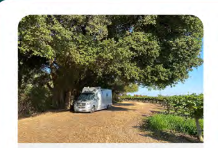
Camping at a Winery